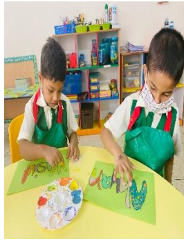
Sharing Class Activities