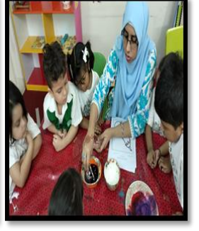
Baking is fun with friends!